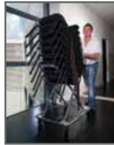
Move & Store Cart