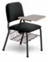
Folding Tablet Arm and Book/Music Storage Rack